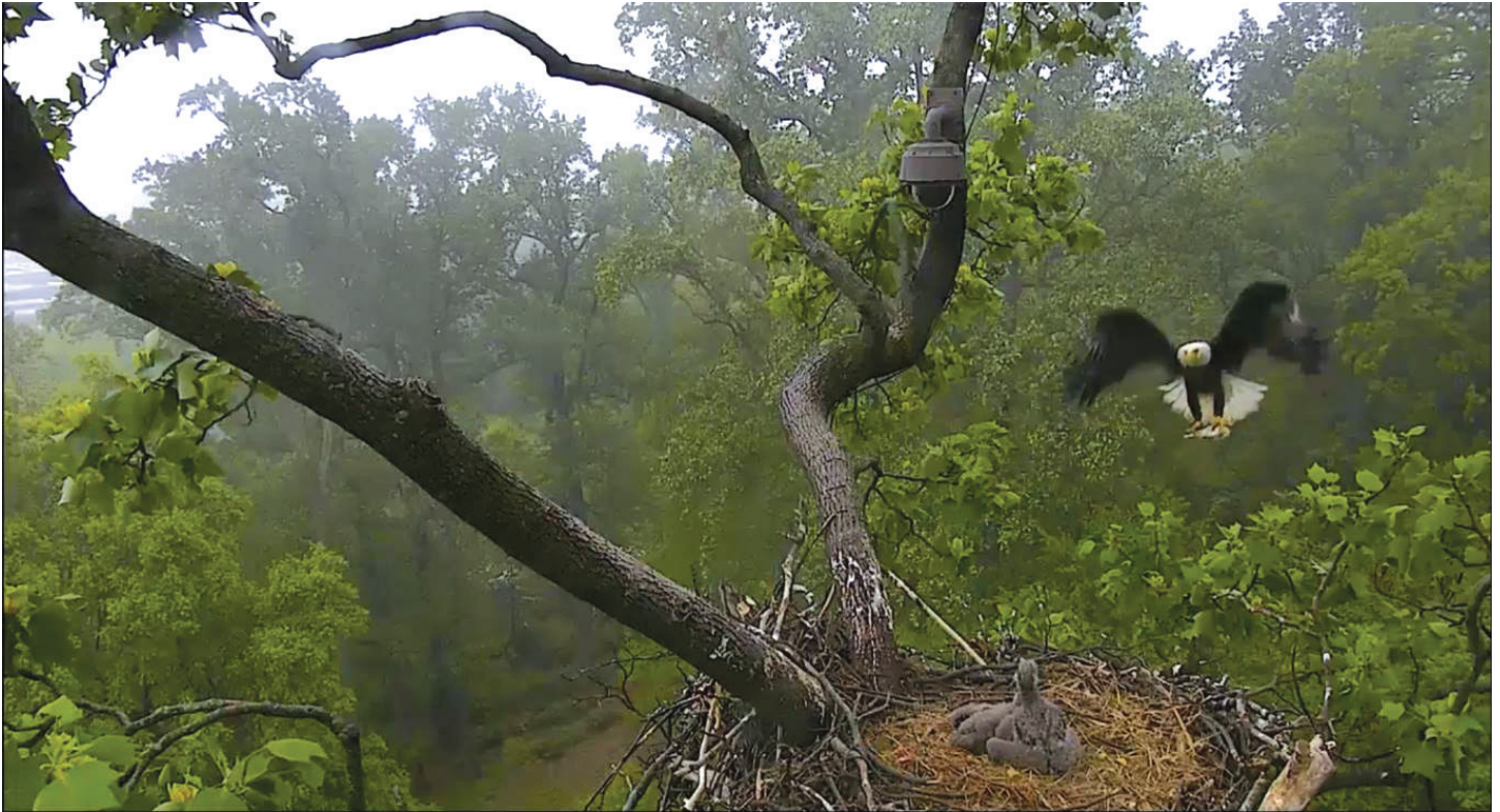
Washington DC Nest - Food Delivery!

This document contains poems and reflections - old and new - about eagles. Some you may recognize because they are included in anthologies. Others are from "Kindred Spirits" whose musings about eagles lead them to put pen to paper. Some have been sent to us to share, and we are happy to do so here.