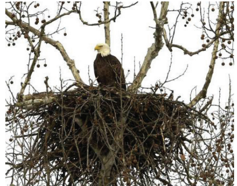
Hope is the new Queen of Treetop Palace!