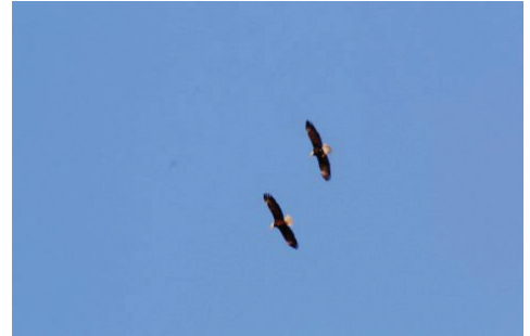
Way up high in a cloudless sky a love story unfolds...