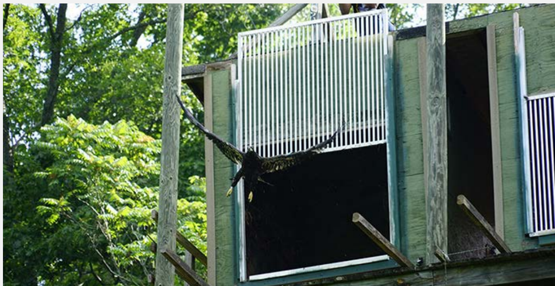
"Invictus" (L6) takes his first flight after spending several weeks in the AEF's hack tower.