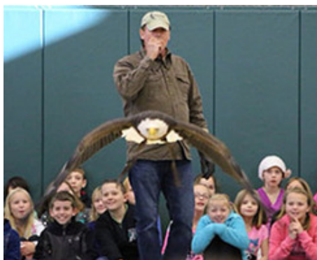
Students were captivated as they watched Challenger fly.