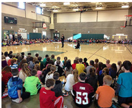
Students from Edy Ridge Elementary School learned about Challenger and eagle conservation.