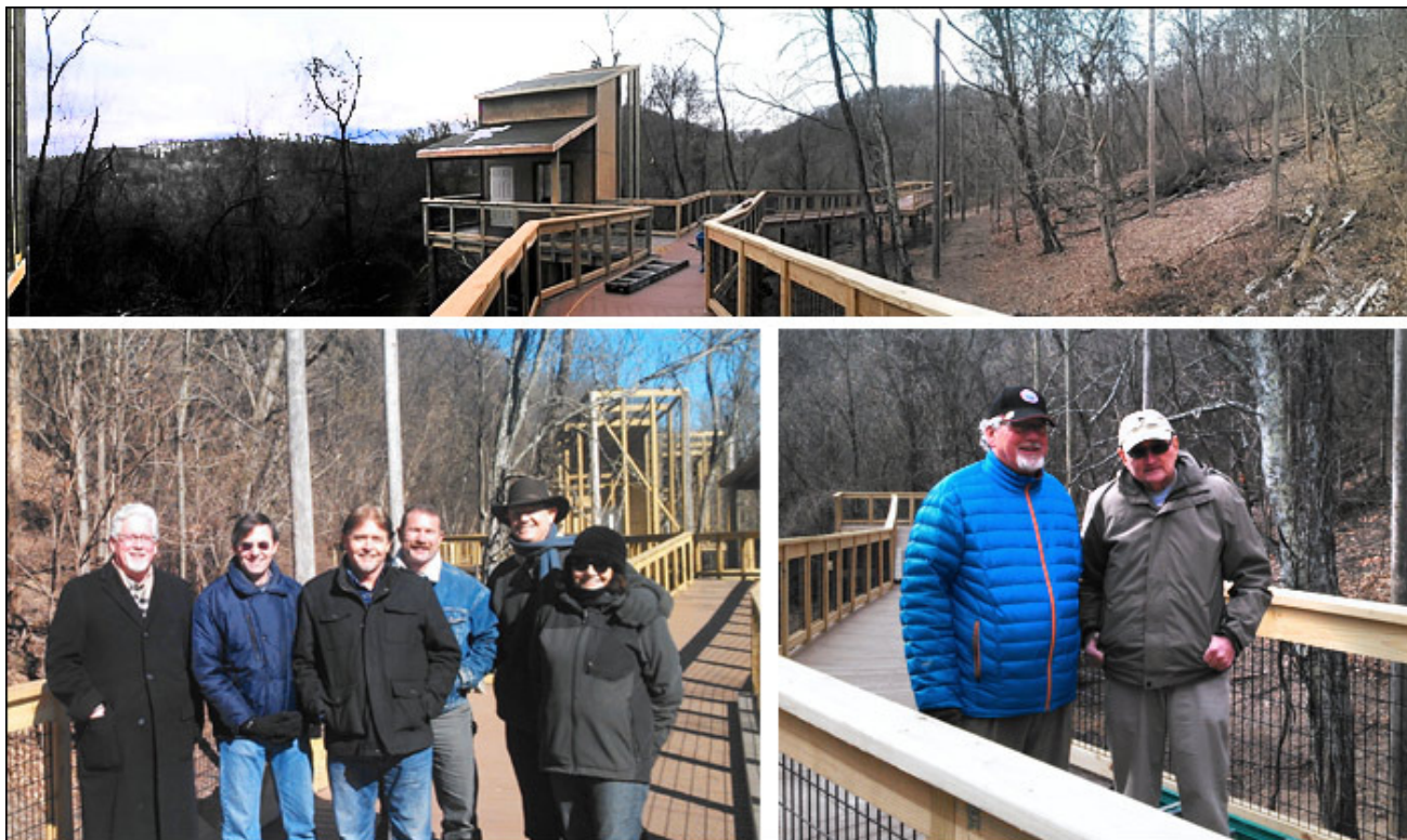
Top photo: panoramic view of Aviary Center at Radnor Lake;