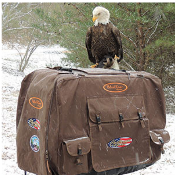
Challenger has a first-class carrier (with awesome cover), thanks to We Move Animals!