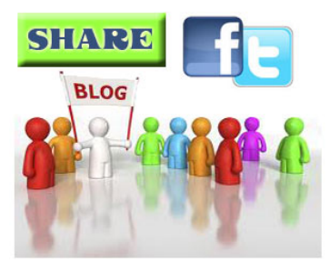
New Blog and Share features on the AEF website

New Blog Feature & Share Buttons Added To "Eagles.Org" Website