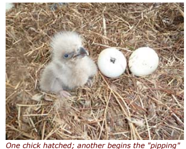
process of breaking through the shell

It's nesting season again for the non-releasable Bald Eagle breeding pairs at the American Eagle Foundation. So far, two Bald Eaglets have hatched this Spring, and we're hopeful that the remaining 5 eggs will produce young within the next week or so.