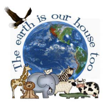
Celebrate Earth Day April 22, 2011

Window On The Environment: Starving Eagles Falling From The Sky