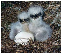
3-day Old Bald Eaglets Hatched At The AEF's Birds Of Prey Facility. Eaglets Were Released Into Wild At 13 Weeks Of Age.

The Bald Eagle is making a gradual comeback to our great country, but, unfortunately, it is not yet home free. Much work still needs to be done to preserve its nesting and foraging habitat, maintain and enforce strict protection laws, and monitor nesting populations nation-wide.